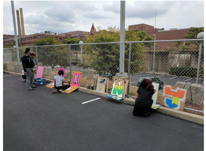
Students at Sarah Heinz House & Manchester Academic Charter School~Middle School- 2017