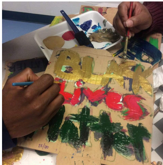
Artwork created by detainees at Shuman Juvenile Detention Center- 2015