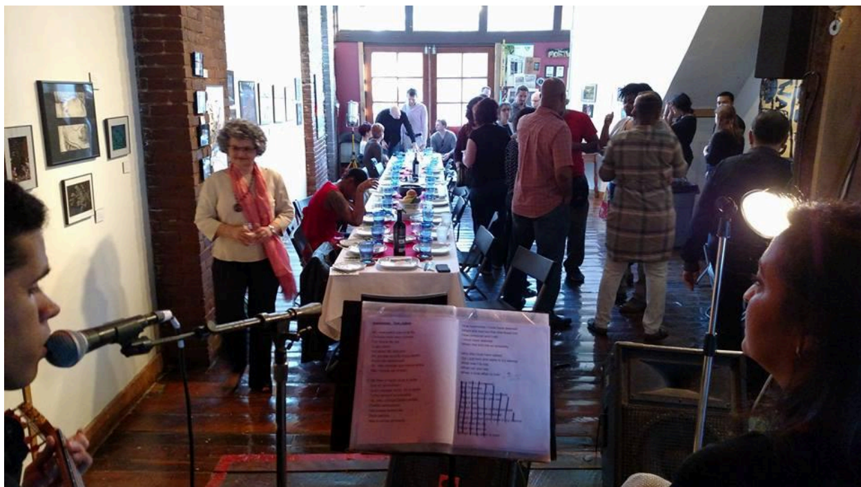
Cafe Con Leche Latino Artist Residency Dinner