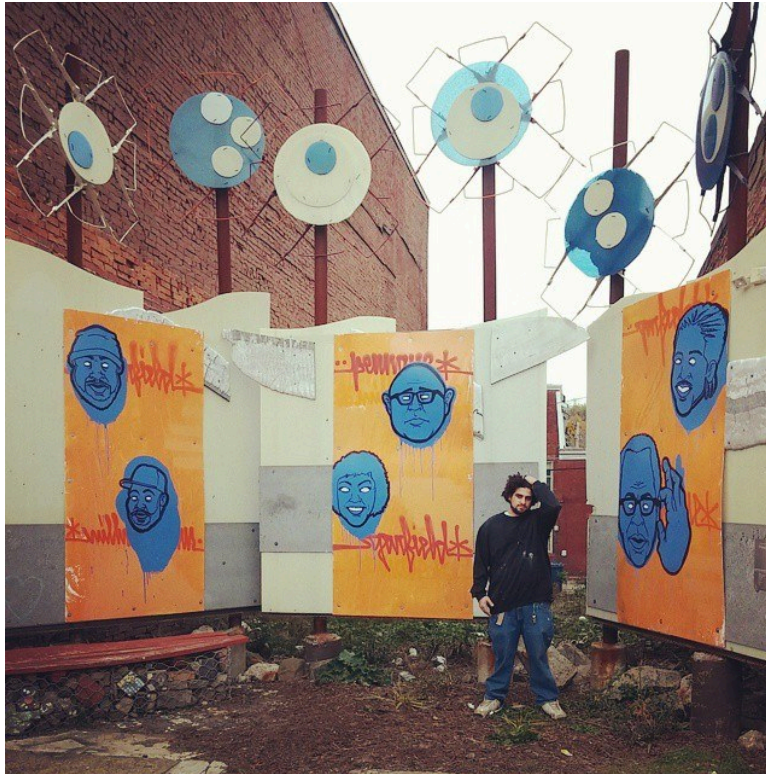
Metal Petals- Green+Screen