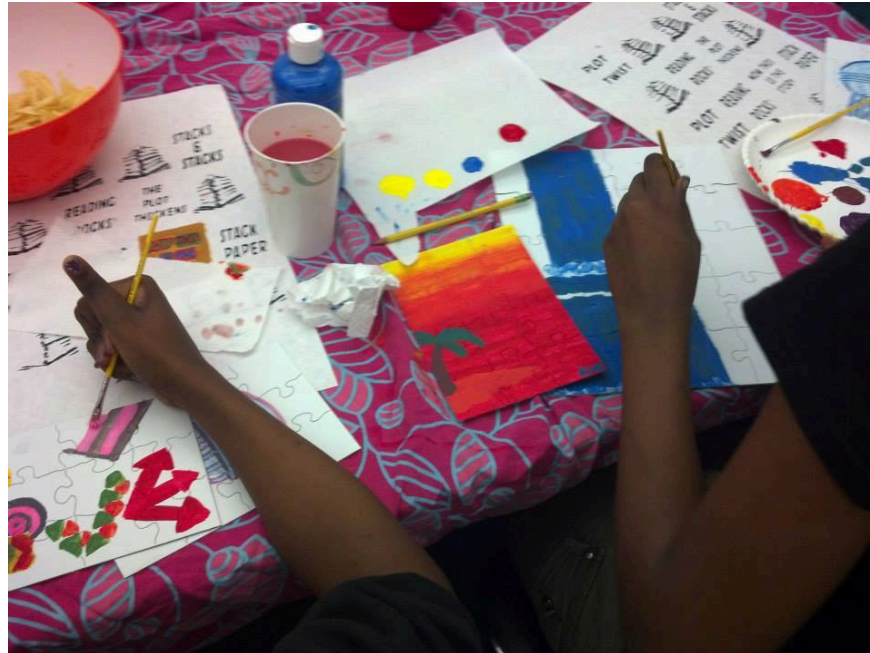
Students at Carnegie Library working on edition variables. - 2014