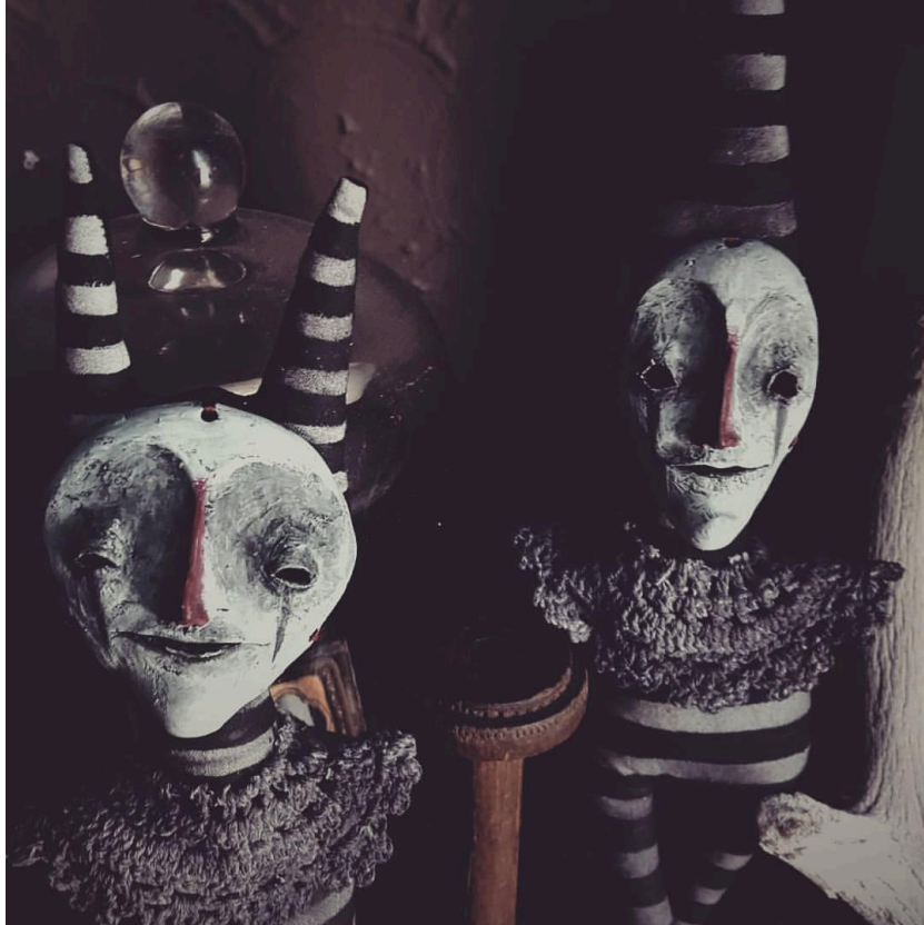
Dolls- Macabre Noir - 2016

Selected Artworks by Students of Jason Sauer